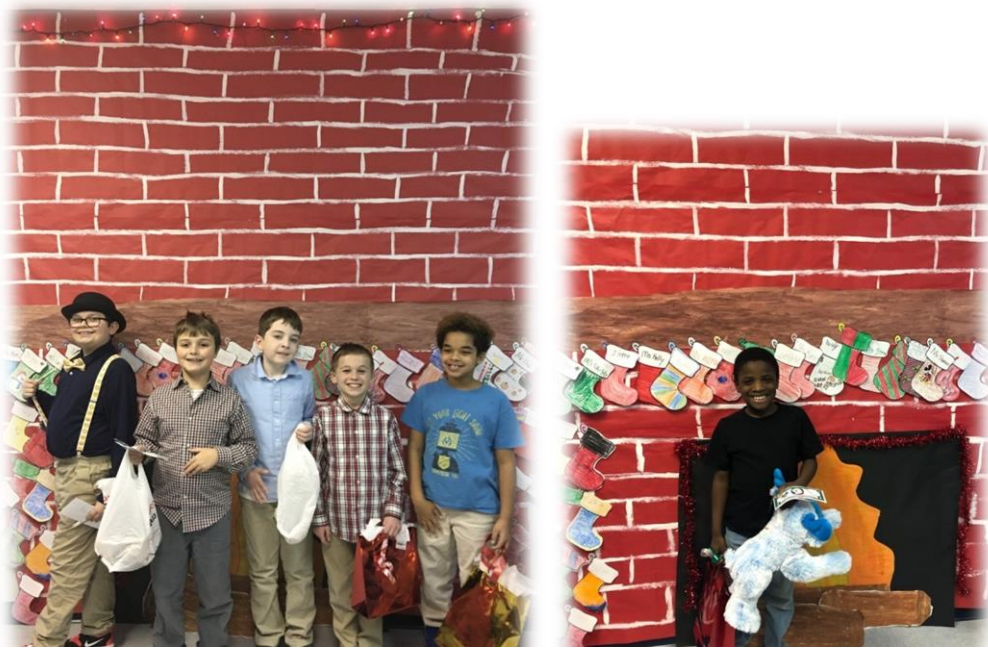
STUDENTS POSING DURING THE HOLIDAY FLEA MARKET