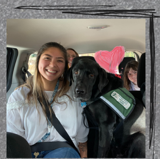
Barley stealing a student seat during our Starbucks trip.

My class's number one memory of Barley was him getting in the trash! They laughed about how often we had to tell him "Leave it!". I also, truly appreciated Barley making all our hard Monday's that much easier by getting pets and putting smiles on our faces during Monday Madness.