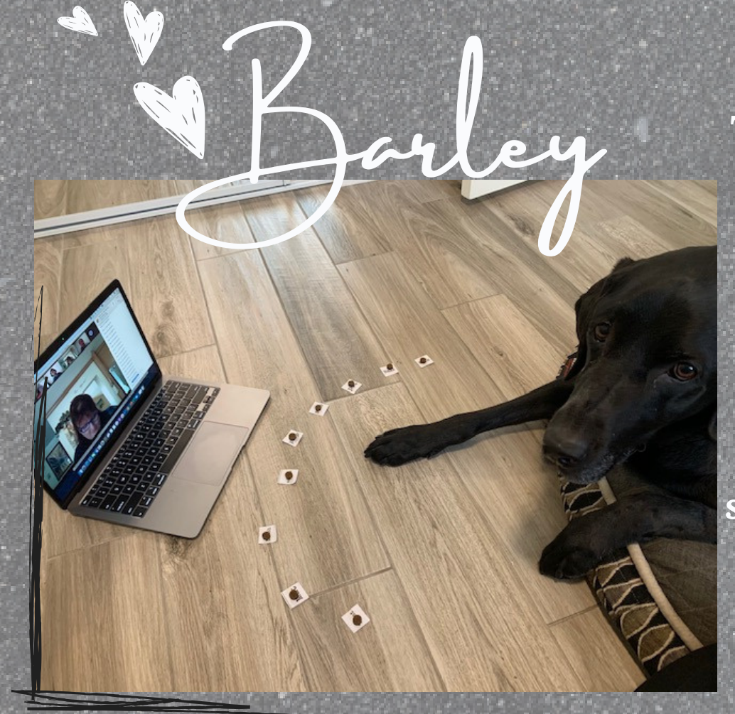
Thank you buddy! We will miss you so much!

Thank you for being a part of the Sierra Team. You were a constant source of entertainment, distraction, and support for all of the students and the staff. Thank you for giving our students a purpose, a sense of belonging, and courage.